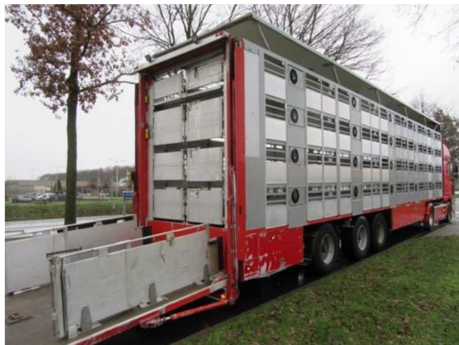
CUPPERS LVO 12-27 ASL