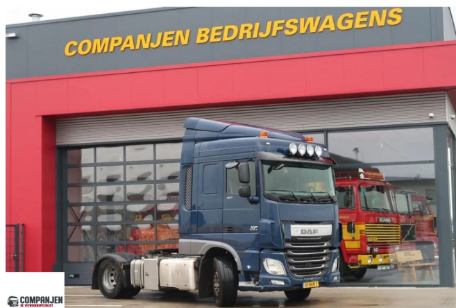
DAF XF 460 HAEN3 - 2016 - Euro 6 - Walking floor + tipper hydraulic 4x2