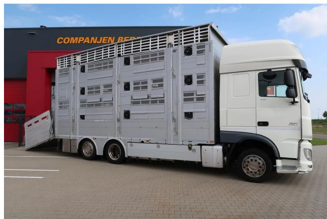
DAF XF 510 Super Space Cab