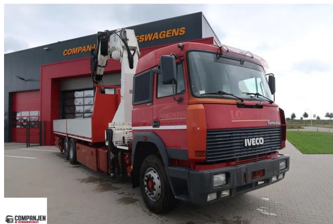
Iveco Turbostar 190.36 190-36 - 1992 - Bonfiglioli - totally complete 6x2