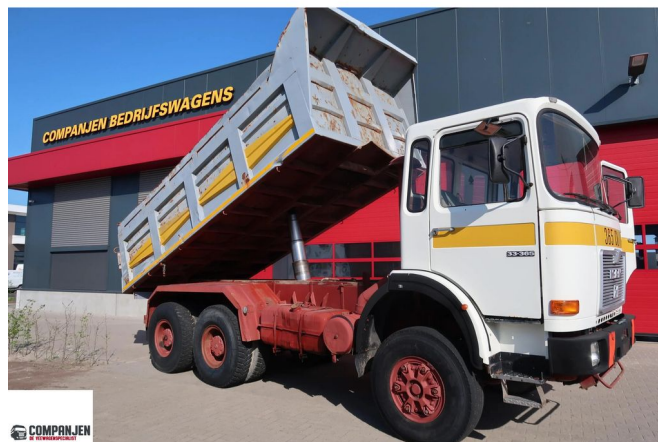
MAN 33 33-365