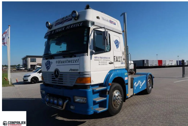
Mercedes-Benz Atego 1828 Atego 1828 LS - 1999