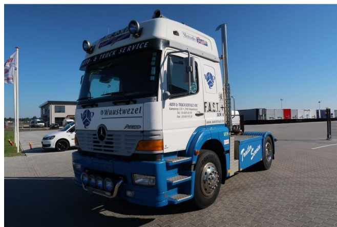
Mercedes-Benz Atego 1828 Atego 1828 LS