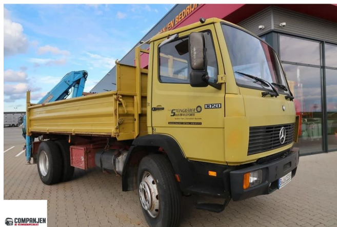
Mercedes-Benz SK 1320 SK1320 - 1988 - Side tipper - Meiller crane -... 4x2