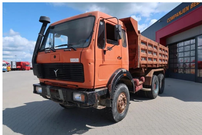
Mercedes-Benz SK 2632