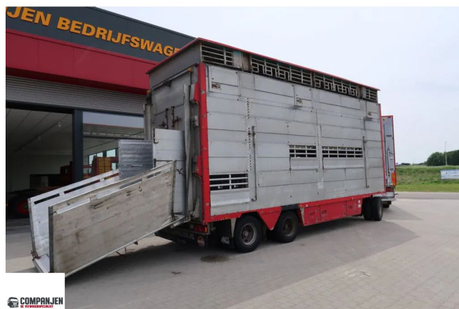
Pezzaioli RBA31 - 2002 - Livestock transport - 2 Floors