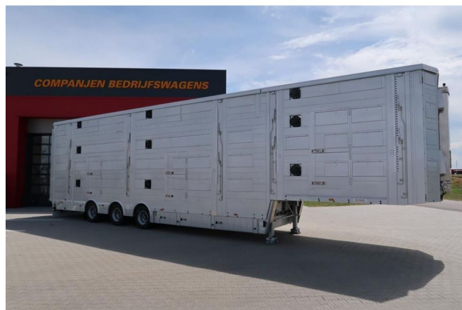
Pezzaioli SBA 31