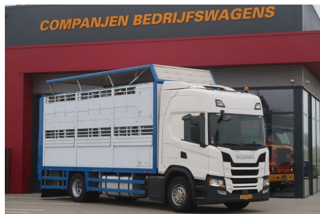
Scania G450 Scania G450 met Cuppers bak