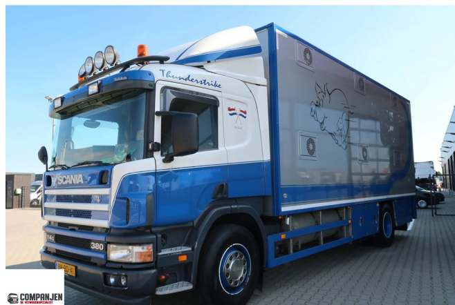
Scania P114-380 114G