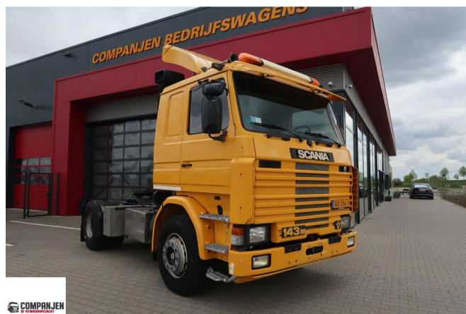
Scania R 143 MA 4X2 143 M