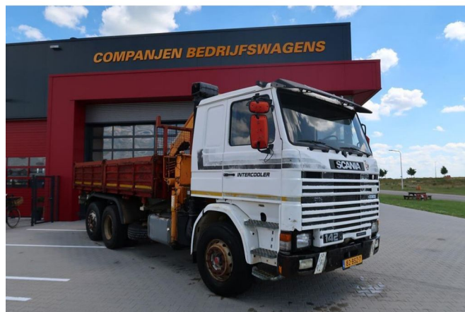
Scania R142-V8 142