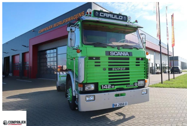
Scania R142-V8 R 142 MA