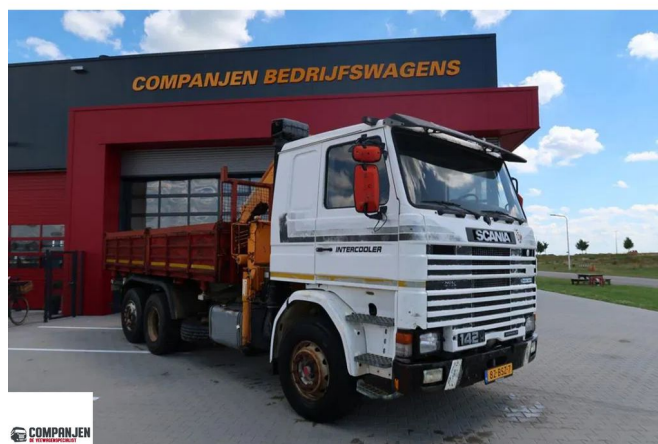
Scania R142-V8 R142 V8 - 1988 - Tipper with crane