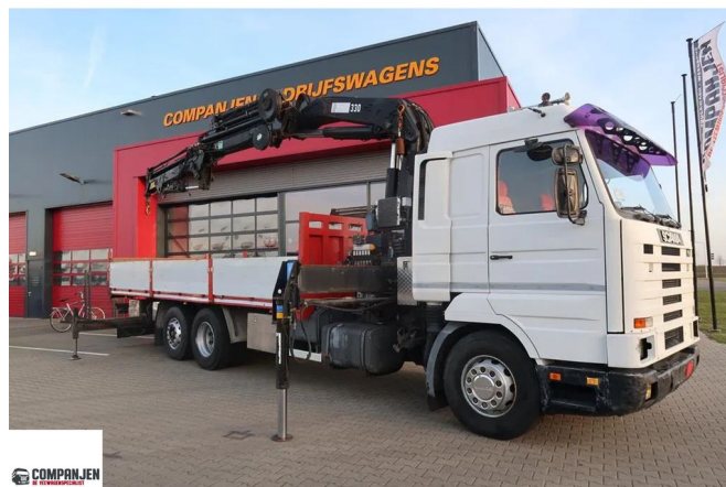
Scania R143-420 V8 Hiab 330-5 - JIB 90