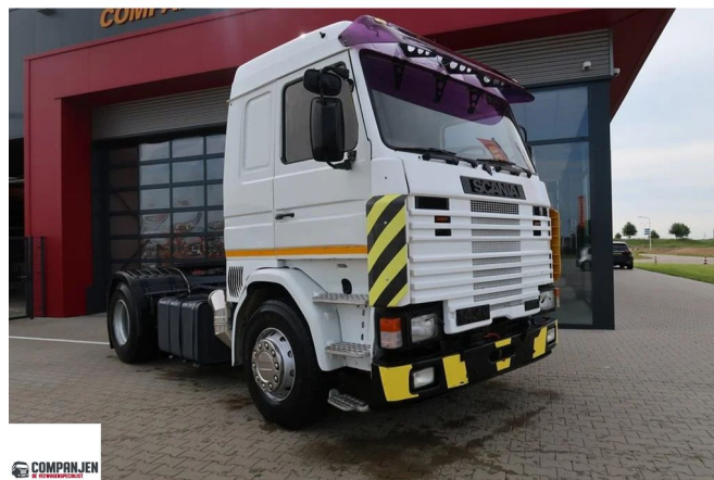
Scania R143-450 V8 143-450 Topline - 1989 - Retarder