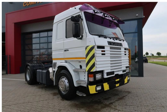
Scania R143-450 V8 143-450 Topline