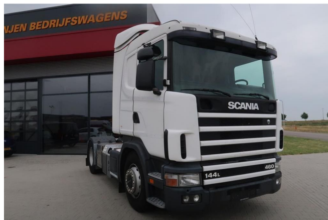
Scania R144-460 V8 144L - 460