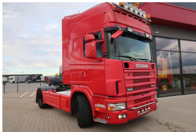
Scania R164-480 V8