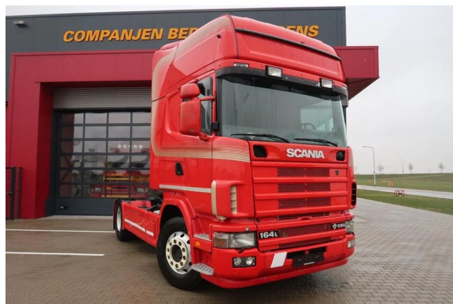
Scania R164-580 V8 R 164