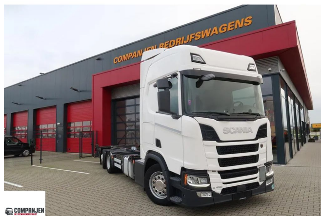
Scania R450 NGS R450