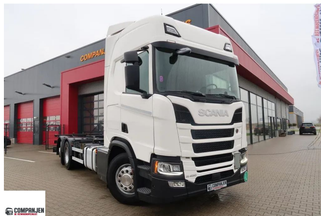
Scania R450 R450 - 2019 - Euro 6 - BDF - Retarder 6x2