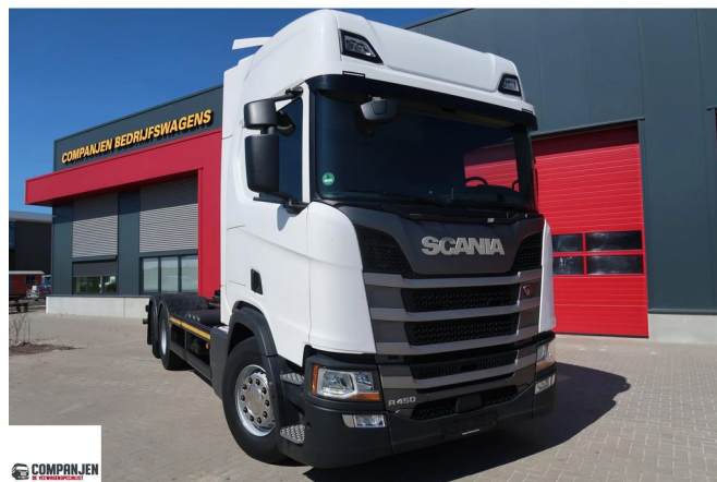
Scania R450 R450