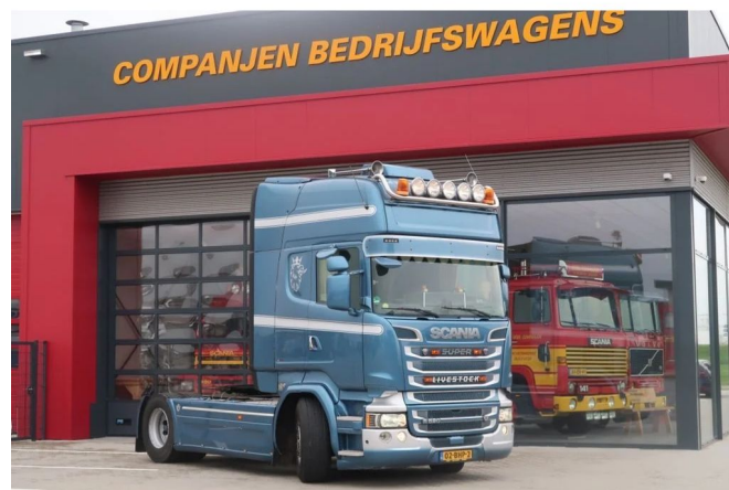
Scania R520 R520