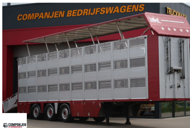
Van Hool Bekkers Type 1 92.10 m2