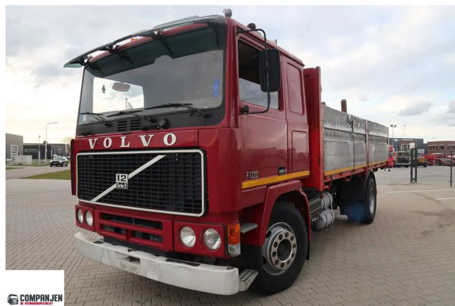
Volvo F 12 F 12-20 - 1976 - Oldtimer