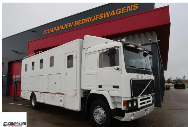
Volvo F 12 F12-20