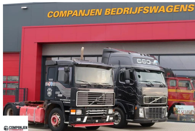
Volvo F 16.485 F16 - 485 - 1989 - Oldtimer