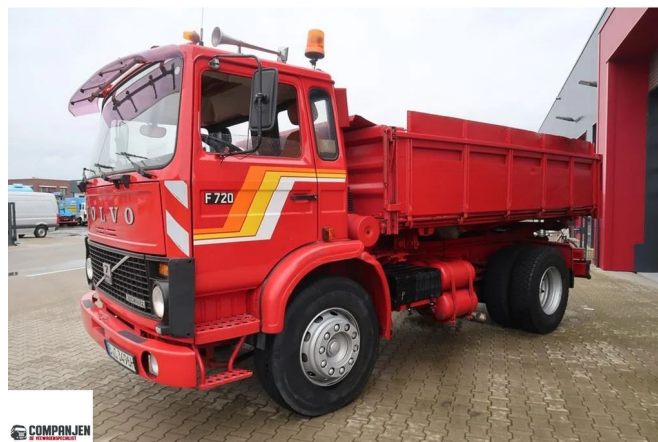
Volvo F 7 F 720 - 1982 - 3 sides tipping - rear crane - Oldtimer