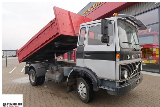
Volvo F F 408 - 1980 - Tipper - Oldtimer