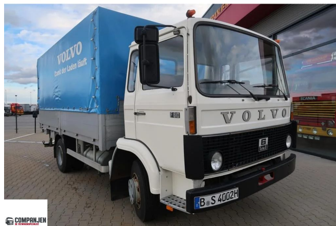
Volvo F F6-10 - 1981 - Tarpaulin with loading ramp - Oldtimer