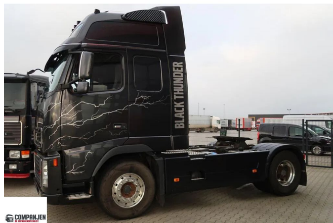
Volvo FH 16.660 FH 16