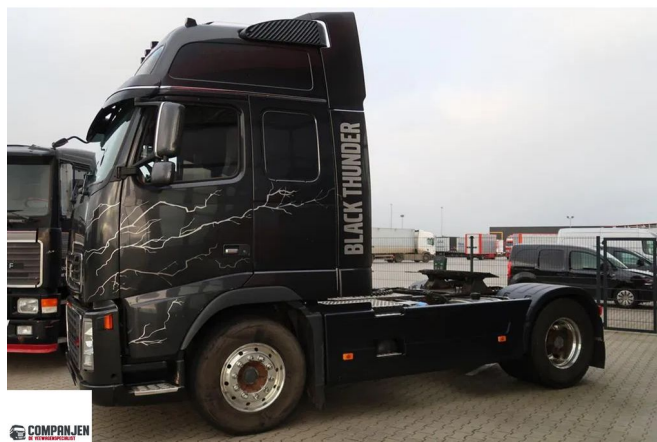
Volvo FH 16.660 FH 16.660 - 2007 - Euro 4 - Retarder