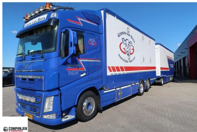
Volvo FH FH 500 - Livestock transport