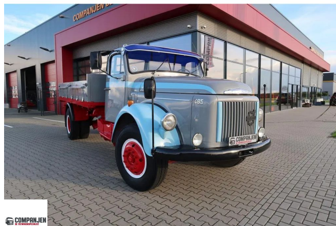
Volvo L L 485 - 1963 - Oldtimer