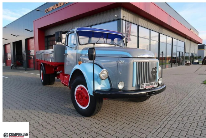
Volvo L L 485