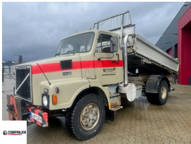
Volvo N 12 N12 - 1987 - Tipper - Oldtimer