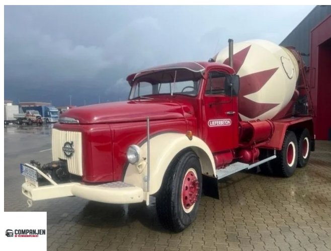
Volvo N N88 - 1973 - Concrete mixer - Oldtimer