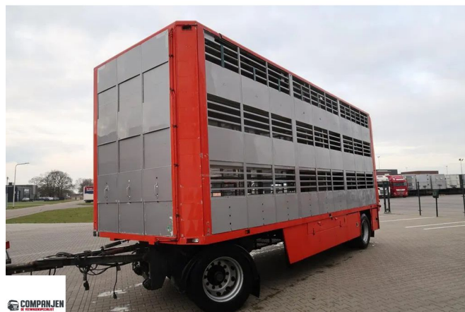
CUPPERS LVA 10 10 - 3 floors - pigs transport

???? ?????? ?????????????? 19-02-1998 ?????????????????????? ?????? ?????????????? 53002 ??? 7.920 kg ?????????????????????? 12.080 kg ??????? ?????? 20.000 kg