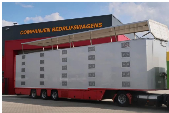
CUPPERS LVO 12-27 AL 5 LEVELS

????? ??????? ?????????????? 08-05-2014 ?????????? ????? OS-20-YJ ??? 10.900 kg ????????????????????? 28.100 kg ??????? ?????? 39.000 kg ?????????? ????? 910 ?????? 1.393 cm ??????? 260 cm