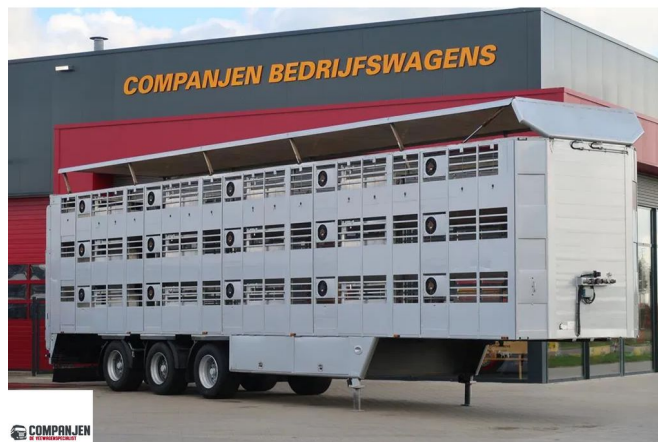
CUPPERS LVO 12-27-ASL