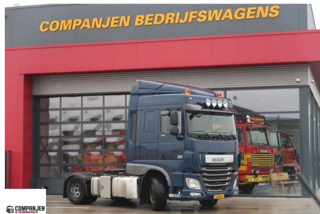
DAF XF 460 H4EN3 - 2016 - Euro 6 - Walking floor + tipper hydraulic 4x2 Referentienummer: 31BGX2