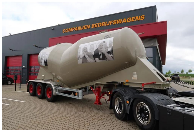
Diversen Filliat XTR32E2

???? ??????? ?????????????? 08-01-1986 ??? 4.870 kg ???????????????????? 27.130 kg ?????? ?????? 32.000 kg