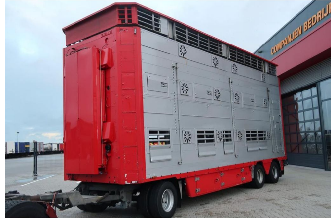
Pezzaioli RBA 31

???? ?????? ?????????????? 24-09-2002 ?????????? ???? WG-JD-19 ??? 8.920 kg ????????????????????? 18.080 kg ??????? ?????? 27.000 kg ?????????? ???? 605 ?????? 820 cm ??????? 251 cm ??????? 400 cm