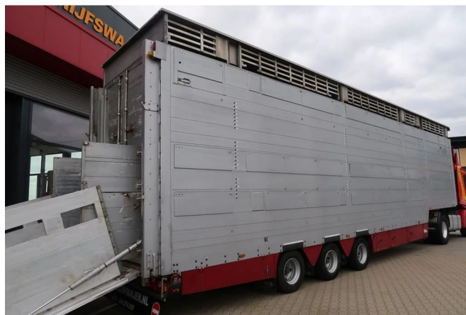
Pezzaioli SBA 31

???? ??????? ?????????????? 17-01-2009 ?????????? ????? OJ-01-YS ??? 11.000 kg ???????????????????? 28.000 kg ?????? ????? 39.000 kg ????????? ????? 909 ?????? 1.400 cm ??????? 255 cm ??????? 400 cm