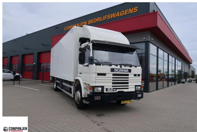
Scania PM 4X2 AL 60 100 P 82 M