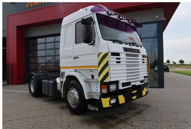
Scania R143-450 V8 143-450 Topline